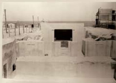
The Mustapha Kamel necropolis during the excavation and first restoration of the site in the 1930s.